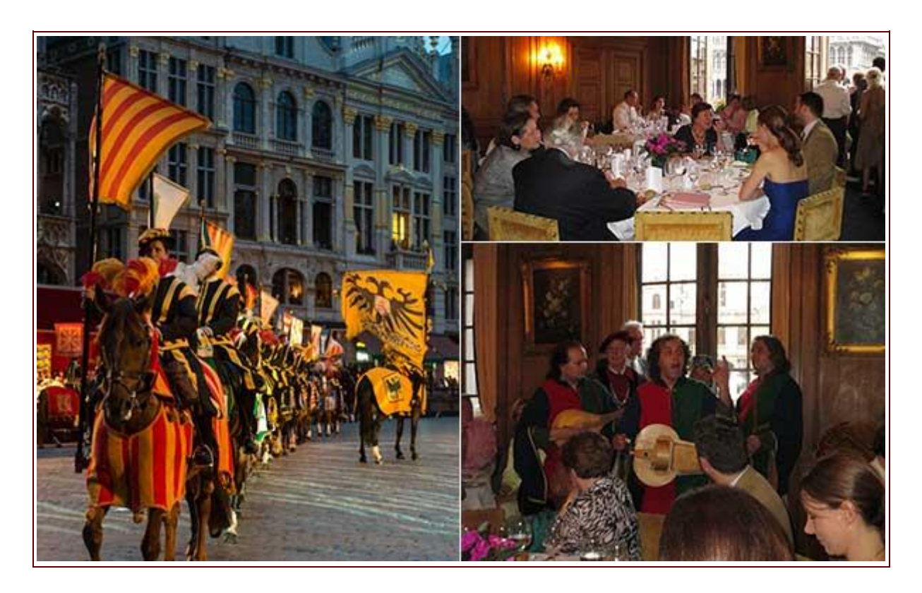
July 2 - Ommegang Dinner